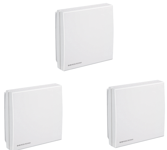
CO2 Sensors c/w NDIR type transducer +/- 40ppm